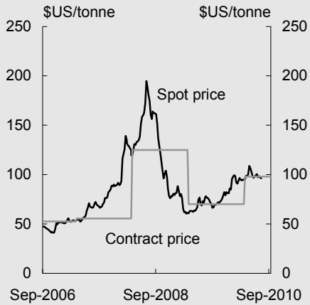
Chart B: Thermal coal spot and contract price

Thermal coal and metallurgical coal contract price forecasts are consistent with current spot prices (Chart B).