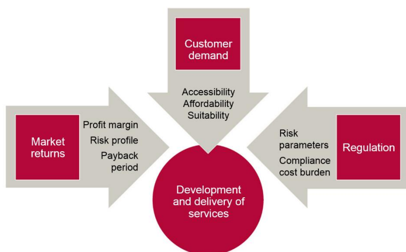
Figure 1: Three External Forces

Given there are no overarching principles or direction to align sector participants' needs and obligations, the banks' role as a distributor of capital across the economy is shaped by three major external forces: customer demand, market return and regulation. These three drivers shape the range of services and offerings, the operations and the strategic direction of the bank.